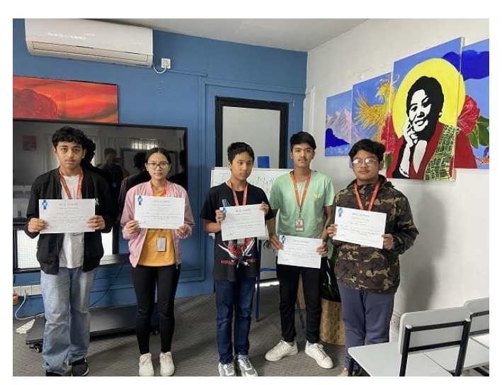
Field Visit | Grade 9 & 10 | Shrawan 30, 2080

The field visit to "BP Koirala Memorial Planetarium, Observatory and Science Museum" was conducted successfully. A wide range of scientific topics, including physics, biology, astronomy, geology, and more, were covered during the tour. The bridge between the students' theoretical knowledge and practical knowledge was enhanced as they were able to witness how scientific discoveries are applied in a variety of contexts, from everyday scenarios to fields of study.