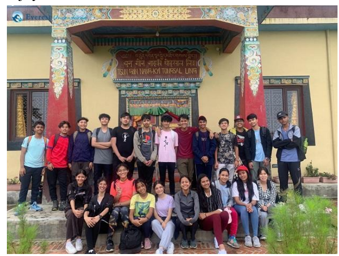
First Term Result Distribution | Shrawan 15

The students of Grade 11 hiked from Budhanilkantha to Nagi Gumba. Throughout the hike, students displayed tremendous enthusiasm and were filled with joy as they had the chance to intimately connect with nature. The hike was educational. exhilarating, captivating, and enjoyable.