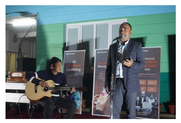
Open mic performance