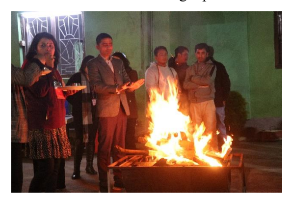
Around the bon fire