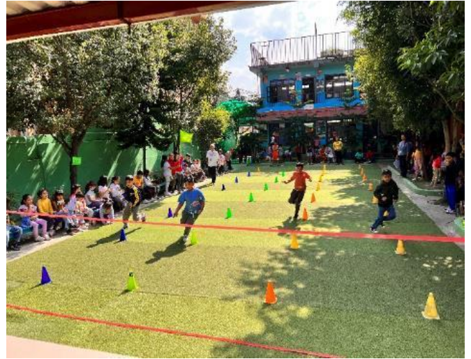
ZigZag Cone race