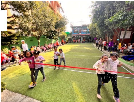
Three Legged Race