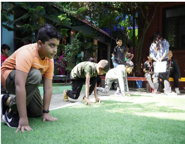
50 m race