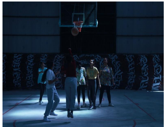
Girls Basketball Shooting