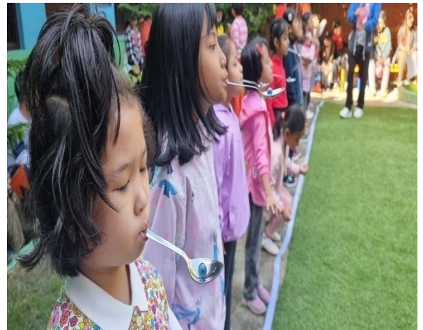
Spoon and Marble race