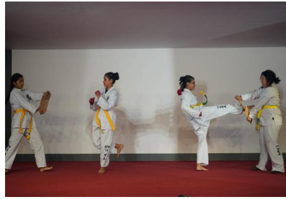
ITF | Grade VII