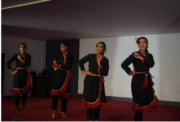
Newari dance | Grade V