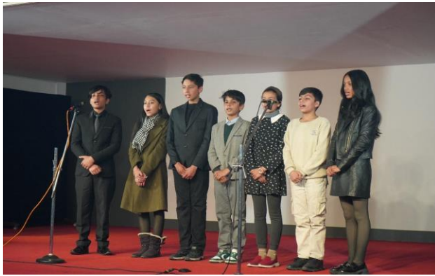
Chanakya Niti | Grade VII and VIII