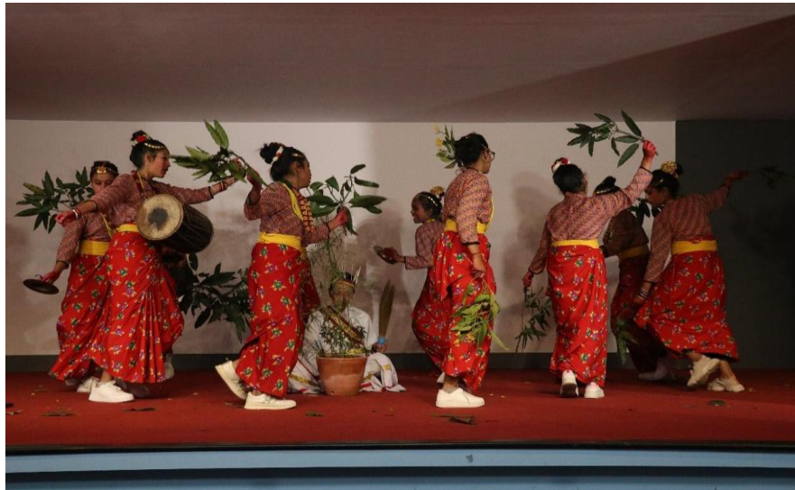
Cultural Dance | Grade VII – Dance Club