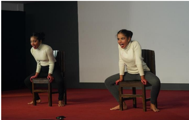
Yog & Meditation Club | Grade VII