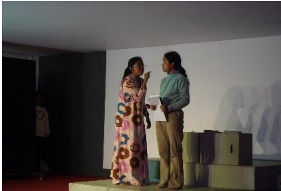
Theatre Club | Grade V & VI