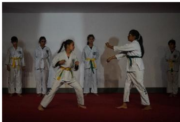
ITF Club | Grade V and VI