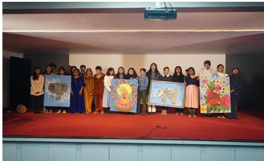
Art and Craft | Grade VII and VIII