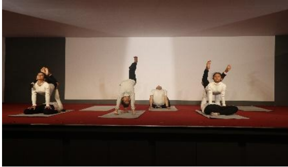
Yoga and Meditation - Grade V & VI