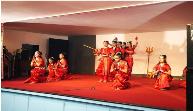
Devi Bandana Dance | Grade VII