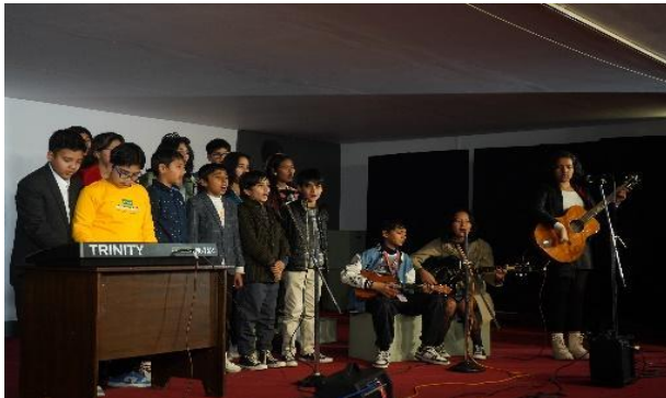
Don't Cry, Music Club | Grade VI