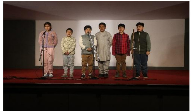
Sanskrit Shloka | Grade V