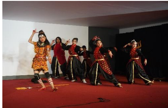
Shiva Tandav | Grade VI

Photos and Videos by: Deerwalk Digital Lab