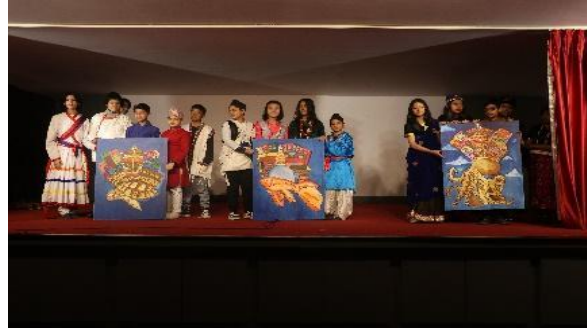
Art Club | Grade V and VI