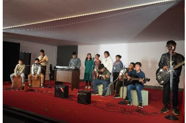
TNT, Music Club | Grade V