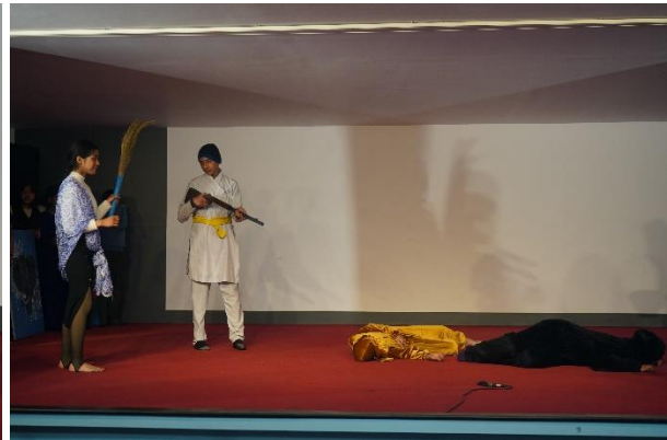
Art and Craft | Grade VII and VIII