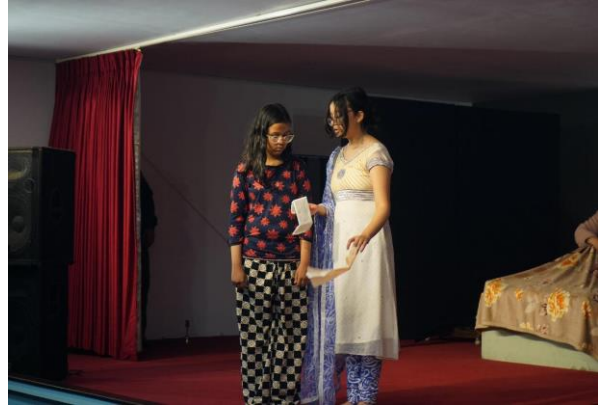
Drama Performance on Mensuration | Grade VII and VIII