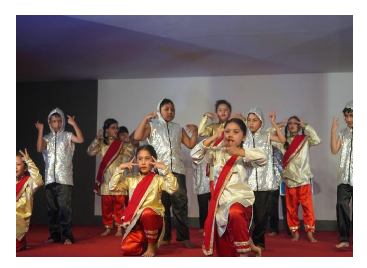
Chasma Lagauli, Grade III Manaslu