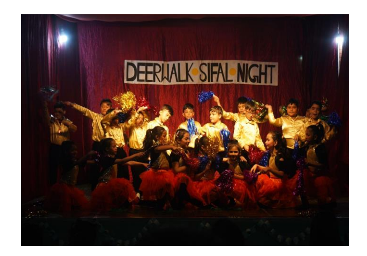
The Next Episode, Grade II Makalu