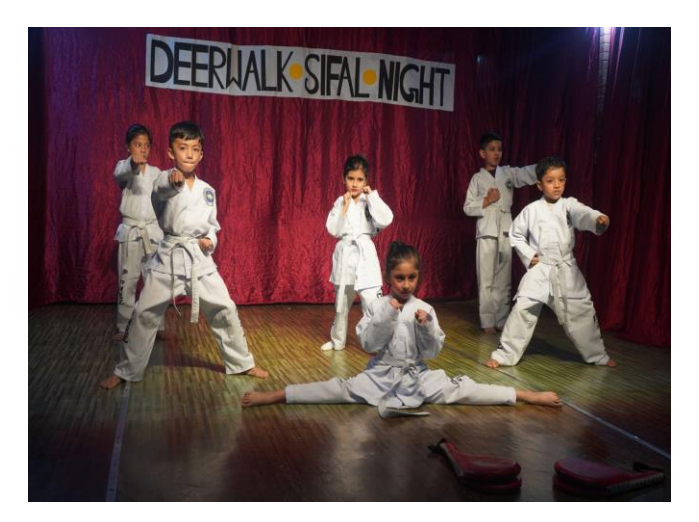
ITF, Grade I-II