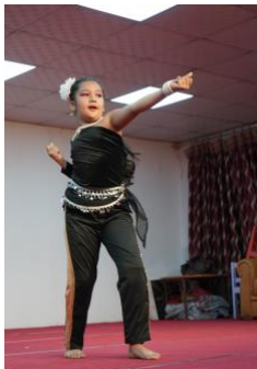
Grade-III, Solo Dance