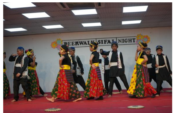
Grade - IV, Himalchuli