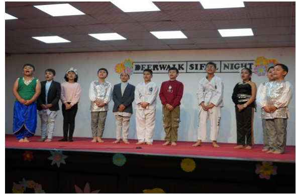
Grade – III, Sanskrit Slok