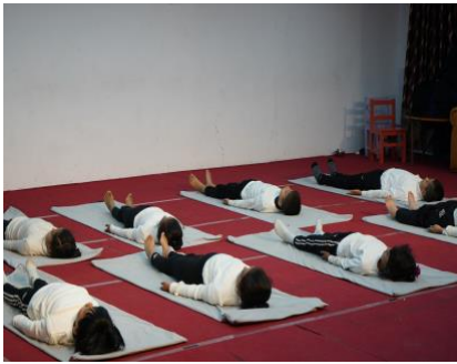
Yog and Meditation