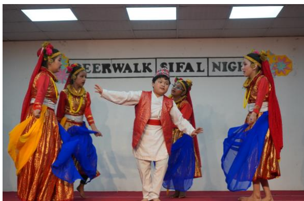
Grade - IV, Annapurna