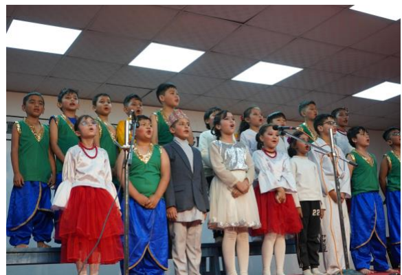
Grade - III, Song "Memories"