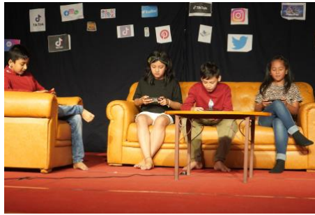
Theater - Excessive Use of Mobile